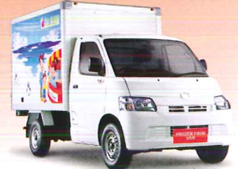
Frozen Food Van