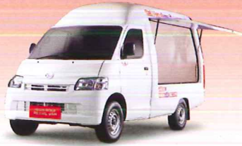
High-Roof Retail Van