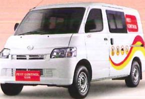
Pest Control Van