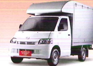
Aluminium Hawker Van