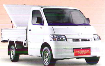
Flatbed Top Pick-up