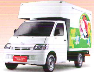
Pasar Tani Mobile