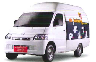
Fiberglass Canopy Pick-up